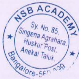
Member Secretary Governing Council

DIRECTOR NSB ACADEMY Sy. No. 85, Singena Agrahara, Huskur Post, Anekal Taluk, BENGALURU - 560 099.